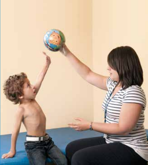
Rehabilitation following a burn trauma